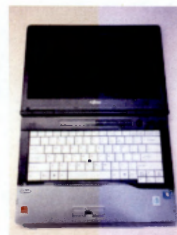
LIFEBOOK S752 notebook computer