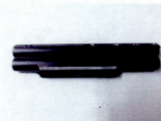
Recalled notebook computer battery pack

To report a dangerous product or a product-related injury go online to www.SaferProducts.gov or call CPSC's Hotline at 800-638-2772 or teletypewriter at 301-595-7054 for the hearing impaired. Consumers can obtain news release and recall information at www.cpsc.gov , on Twitter @USCPSC or by subscribing to CPSC's free e-mail newsletters .